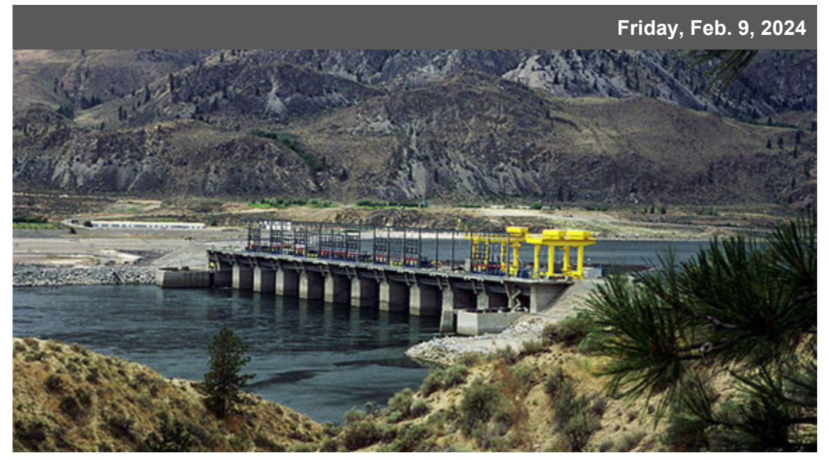
Photo of the week: We continue to make progress on our clean energy targets! We're proud to announce that we've signed an extended power sales agreement with the Confederated Tribes of the Colville Reservation for their 5.5% share of the Wells Hydroelectric Project. The power sales agreement for 40MW of carbon-free capacity started in September 2018 and will now extend through September 2029. Read more about this partnership <u>here</u>.