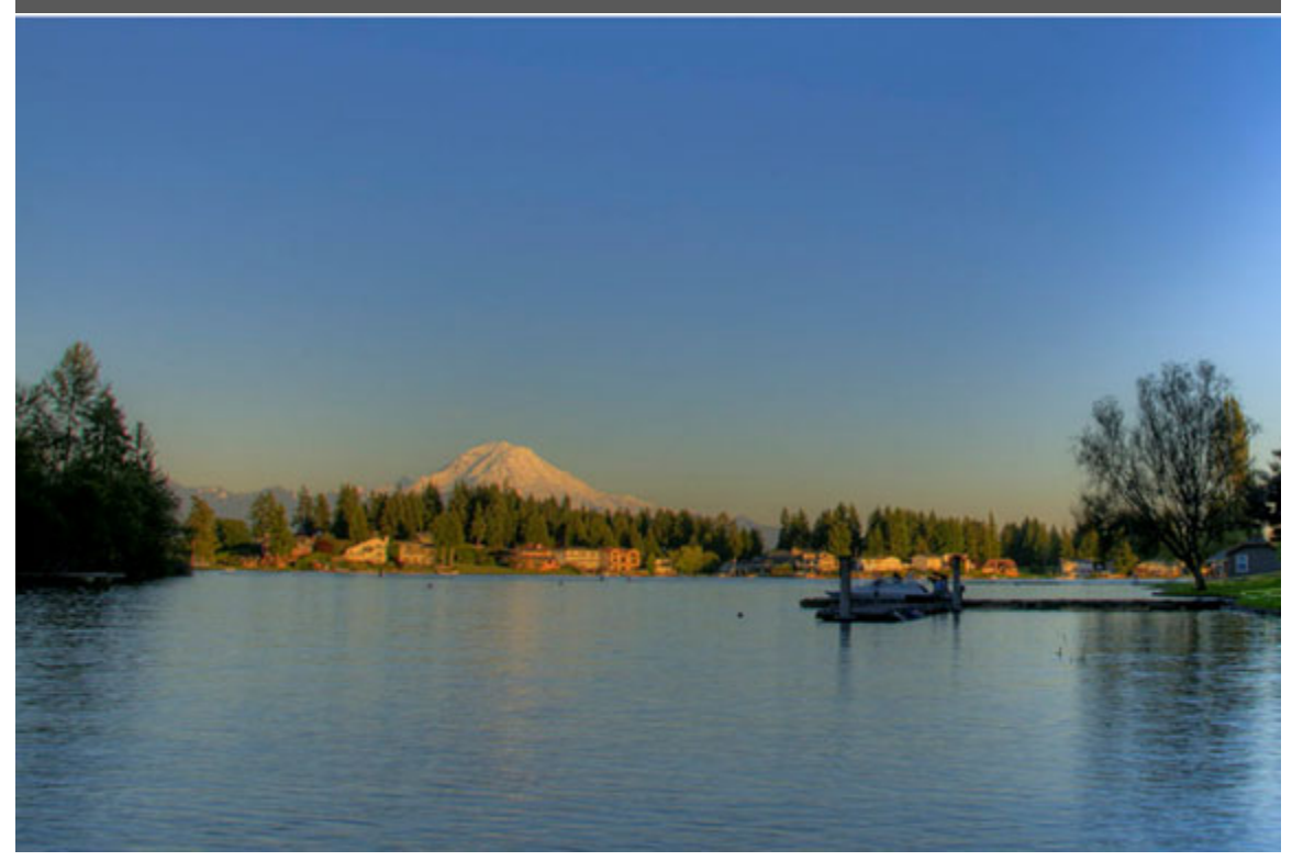
Photo of the week: Long summer days will be here before we know it, and it's almost time to enter to win a week at one of our Lake Tapps cabins or South Loop campsites! The lottery opens on Friday, March 1 — to enter and learn more about this year's process, click <u>here</u>.