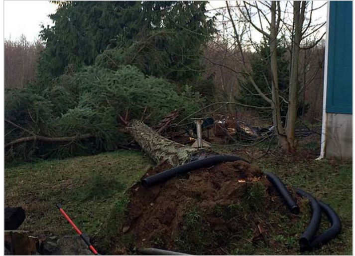
Port Gamble S'Klallam Tribe general manager Kelly Sullivan reported that this tree behind her house 'uprooted like it got picked up and set back down.' It missed a neighbors' home by only feet. No one was injured.

Find more outage information or report your outage at pse.com/outagemap or download the myPSE mobile outage app.