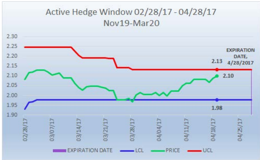
Illustration No. 3

Illustration No. 4 below shows the target delivery periods included in the Plan.