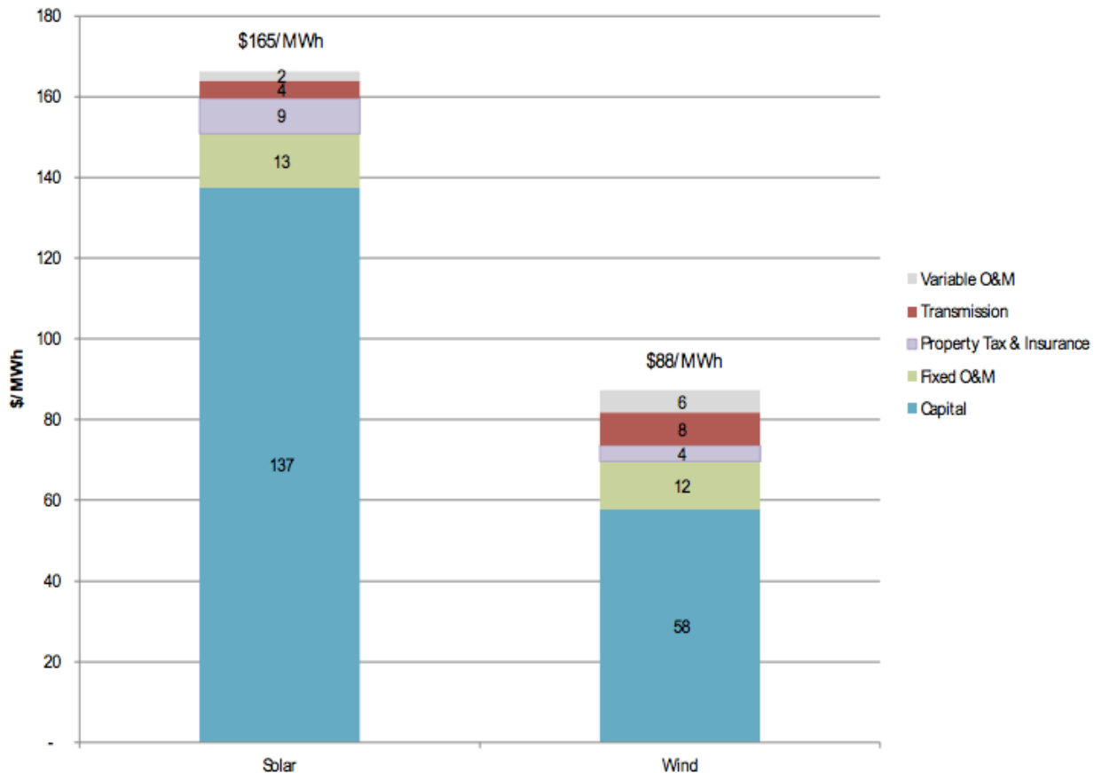
Figure 2—Levelized revenue requirement component breakdown for wind and solar. 23

Renewable Northwest recommends that the Commission encourage PSE to use the most up-to-date resource assumptions for renewable resources. Given the anticipated need for eligible renewable resources in 2023, the falling cost of renewable resources compared to natural gas, and ongoing discussions surrounding the operation of Colstrip, Renewable Northwest looks forward to working with PSE to ensure that wind resources, including those from Montana, are fully explored in the 2017 IRP cycle.