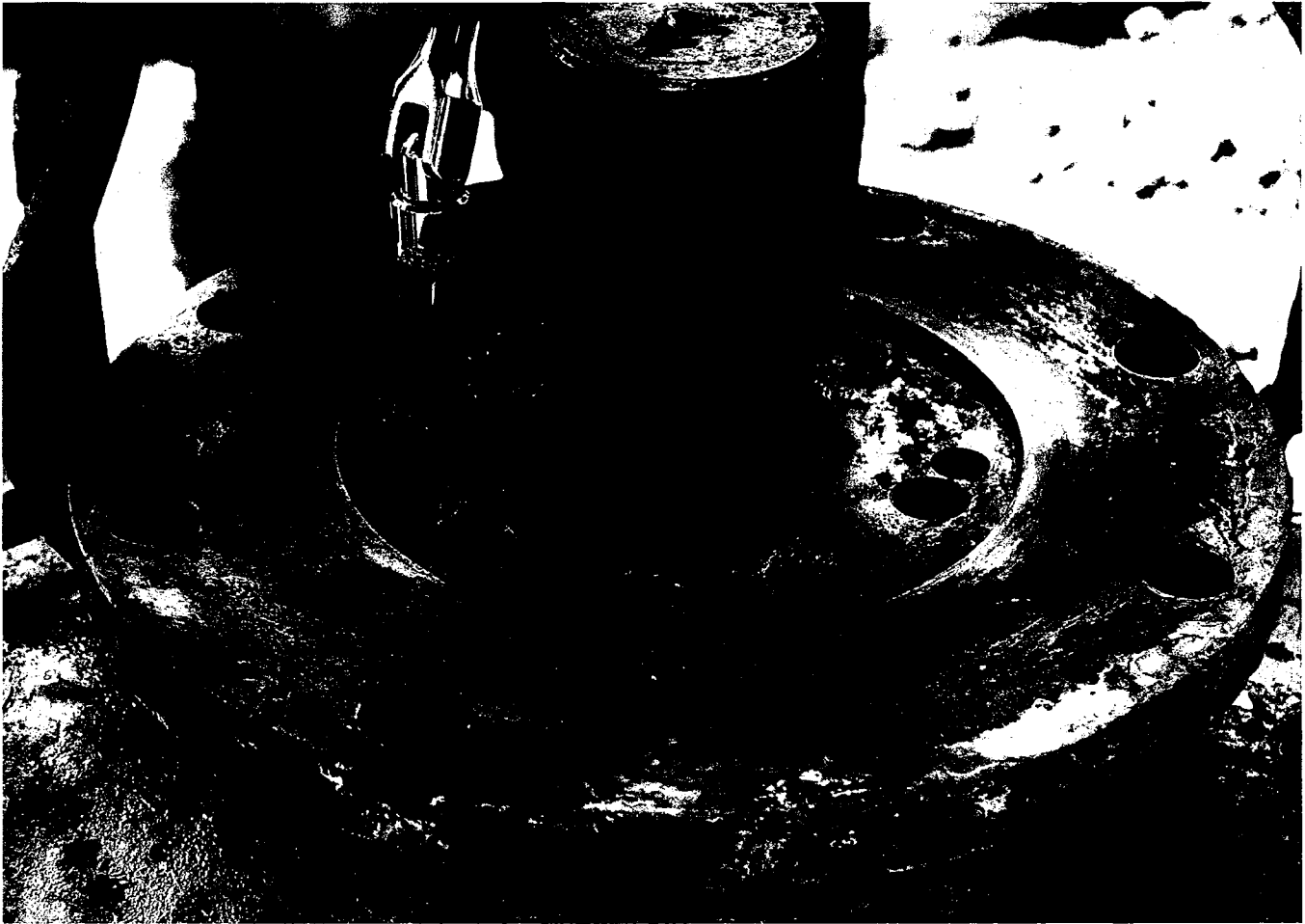
The Cascade Natural Gas crew was removing defective bolts from KBV-2 mainline valve.