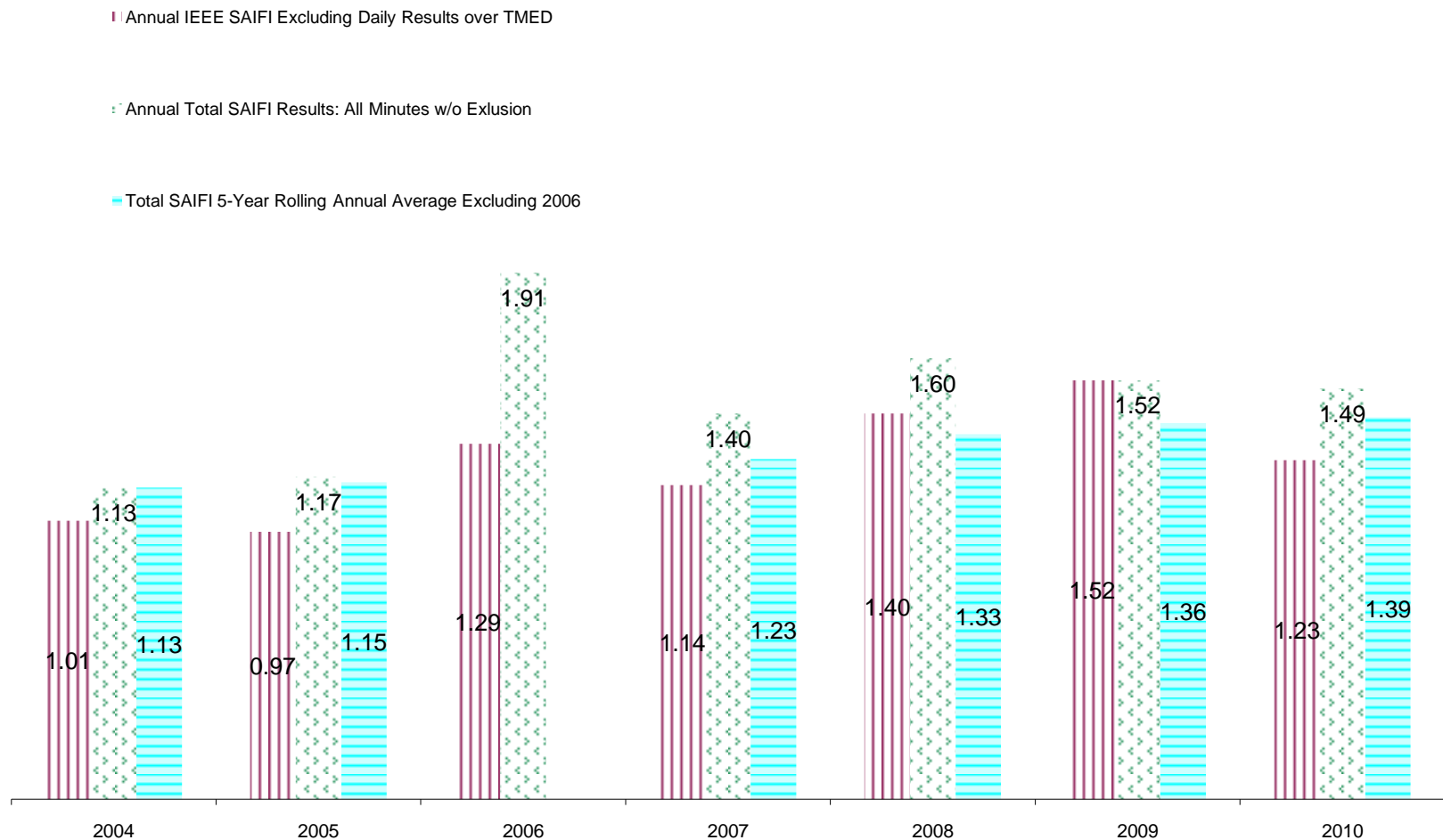
Chart 1: 20XX-20XX AVA SAIFI Performance in Different Measurements by Year