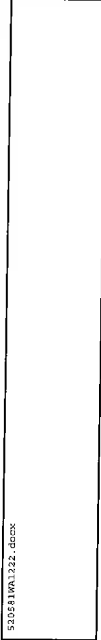
Name of Attached Document

<1210> Terms & Conditions of Voice Telephony Lifeline Plans