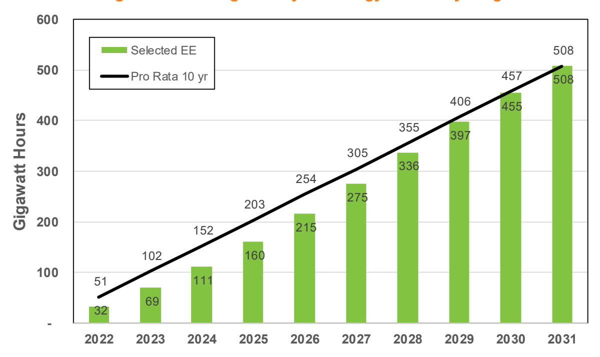
Figure 1: Washington 10-year Energy Efficiency Target