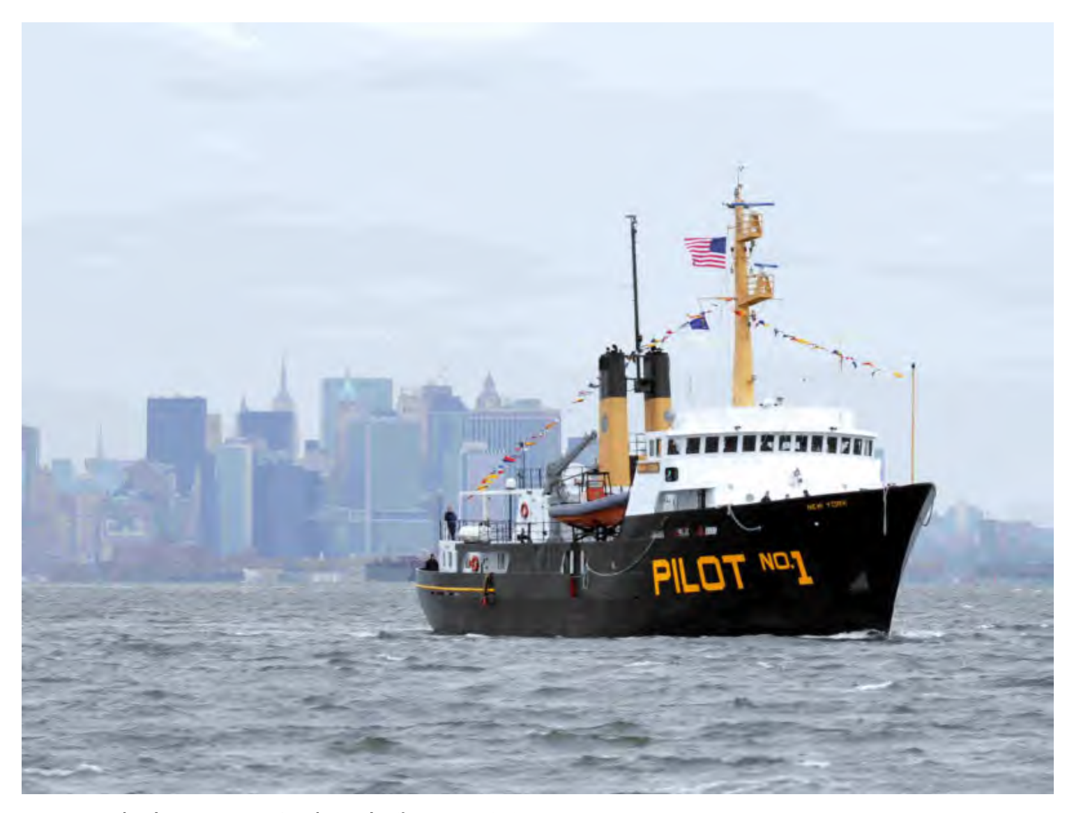
PB New York.