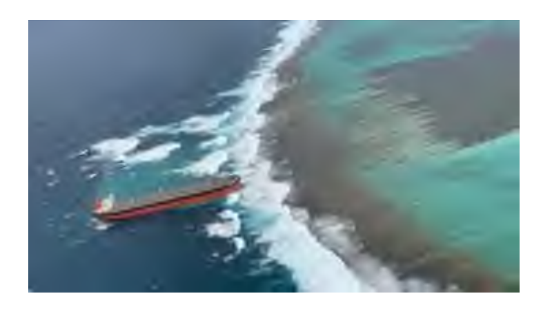
Large Bulk Carrier Runs Aground in Mauritius