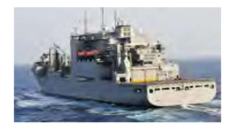
Suicide Aboard Military Sealift Command Ship Prompts Unions to Call for End to