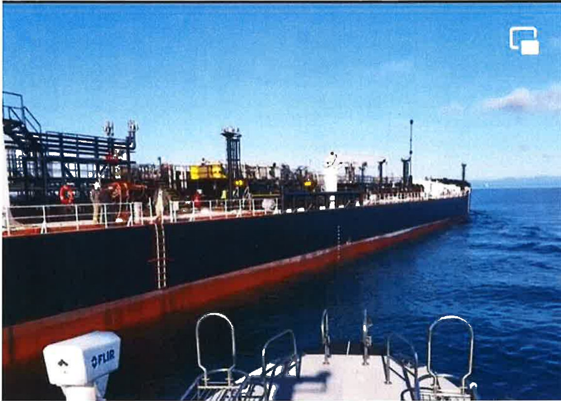
Crowley ATB regular caller in Puget Sound, low freeboard regardless of loading condition, easy to climb, smaller vessel, and yet still a bent spreader bar.