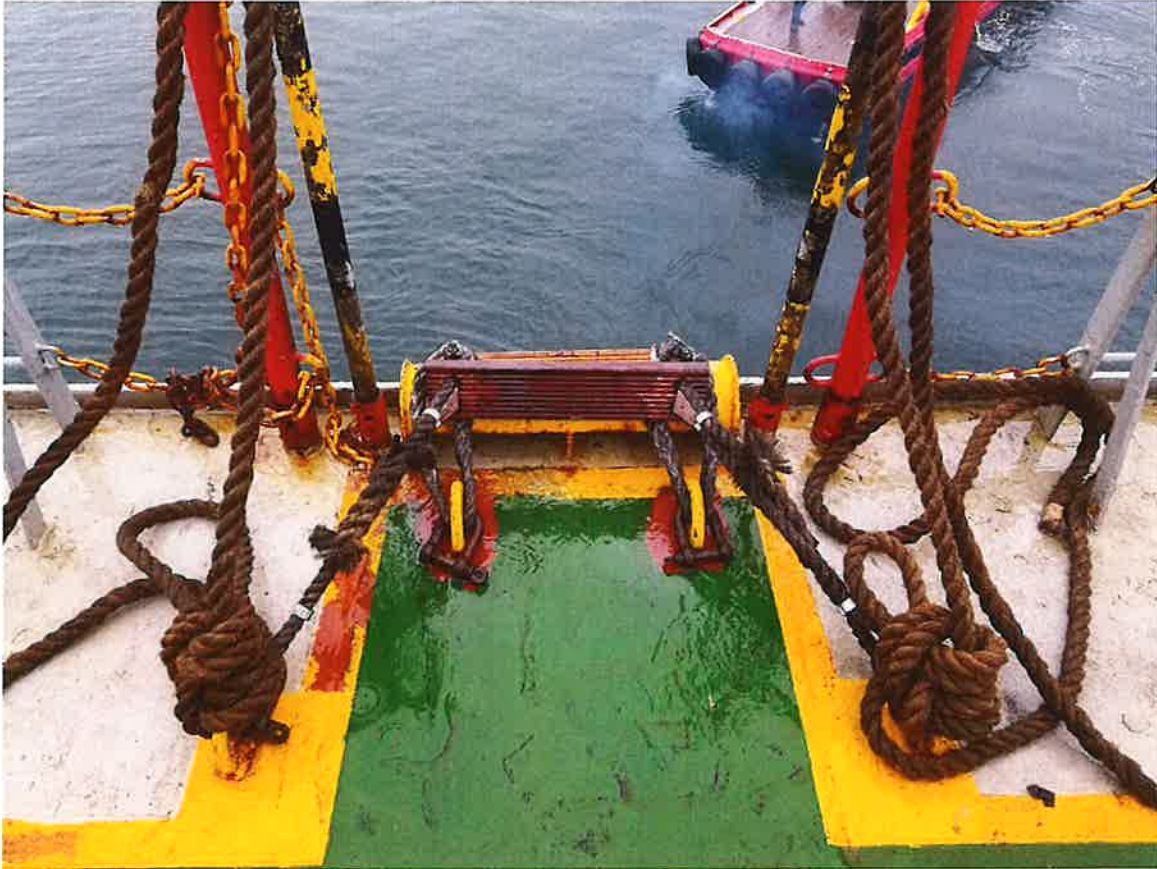
Pilot ladder low freeboard, secured to ship, handrails missing securing pins. This should be the easiest and simplest pilot ladder to rig making it the safest choice on a smaller sized vessel.