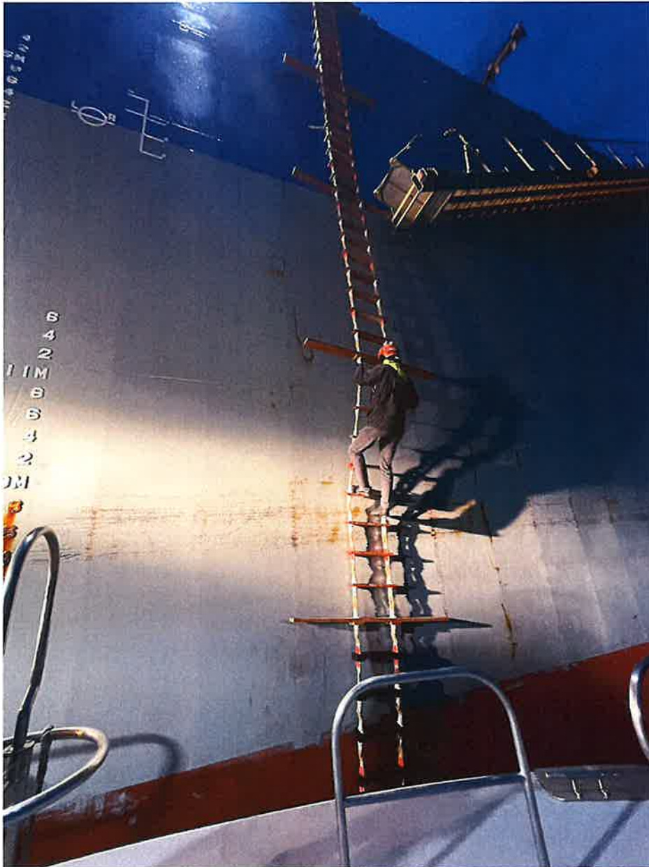
BTG Denali 5/15/22. Large ship requiring combination ladder, Lower platform of combination ladder is not horizontal, requiring the pilot to make a transfer to an uneven sloping surface from the pilot ladder to the combination ladder.