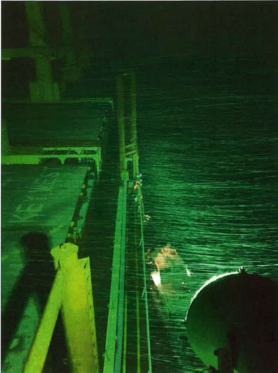
Even low freeboard ships with simple ladders can be dangerous.