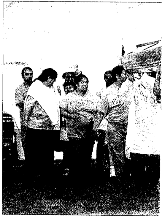
Members of the Aleut Community of St. Lawrence Islands of Alaska, carry a handmade baidarka (Aleut canoe) after expressing their gratitude to other tribes participating in the Tribal Canoe Journey.