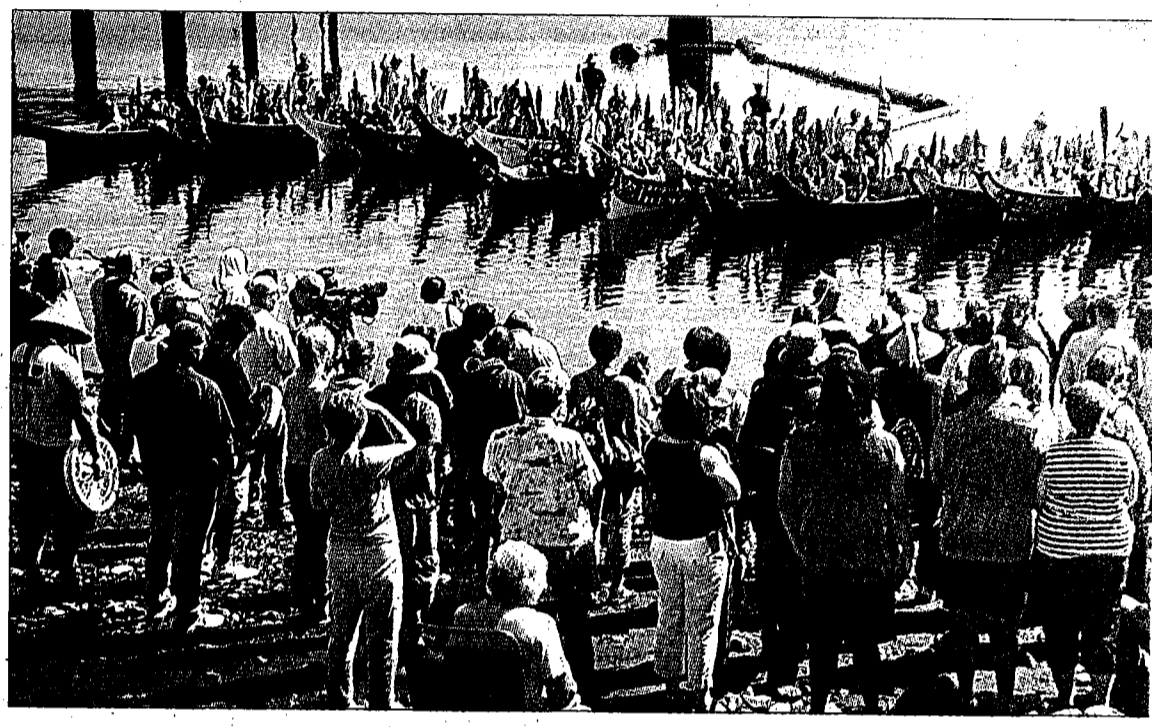
A large crowd and dozens of canoes gather on the shores of the former Tse-whit-zen village, the former residents of the 2,700-year-old site. More photos on Page C1.